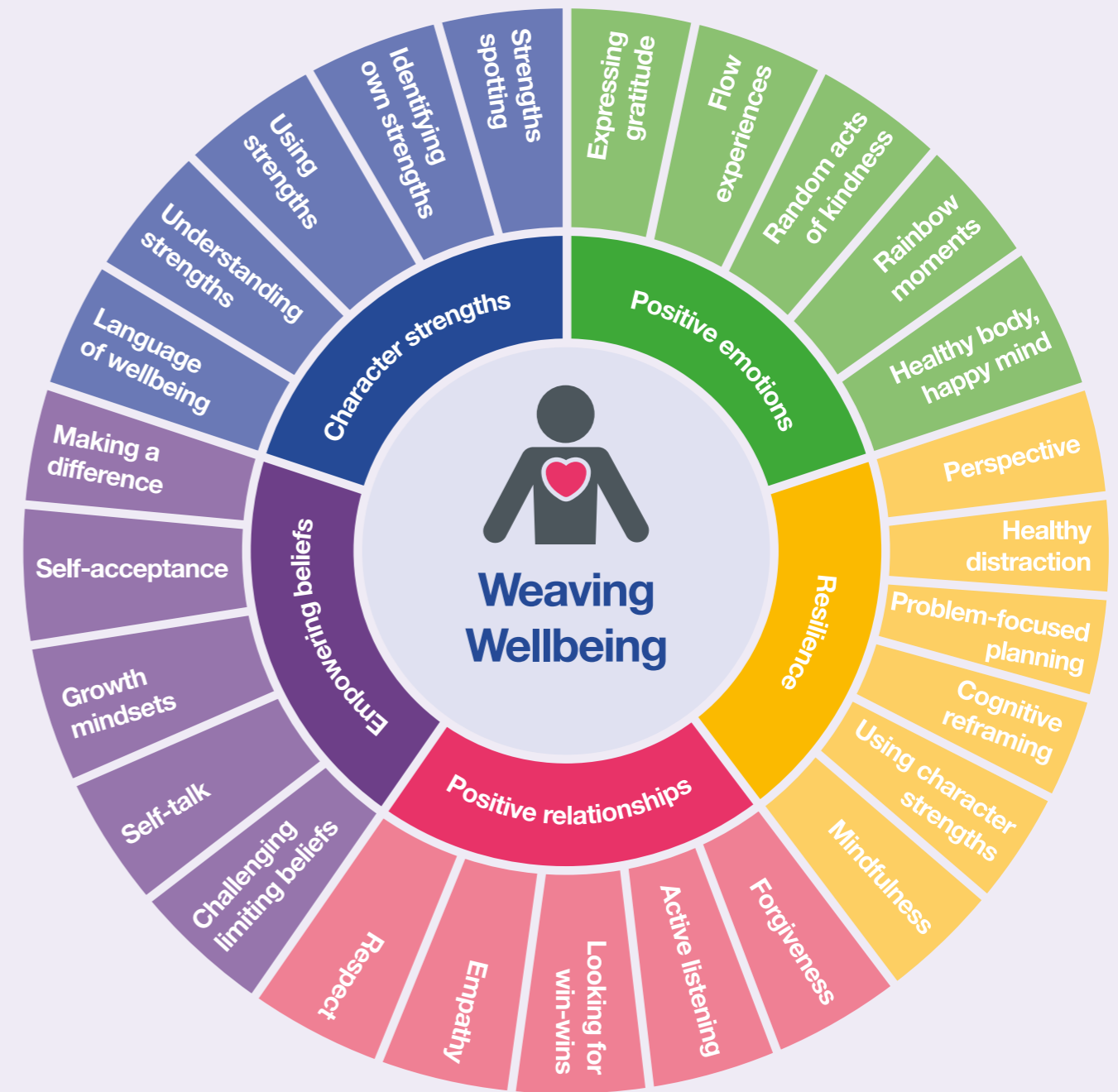
The chart, adapted from weavingwellbeing.com , shows the main topics included in the Weaving Wellbeing programme.

In this way, children learn how to become creators of their own wellbeing. Over the course of the programme, they learn how to weave all the elements of wellbeing into their everyday lives.